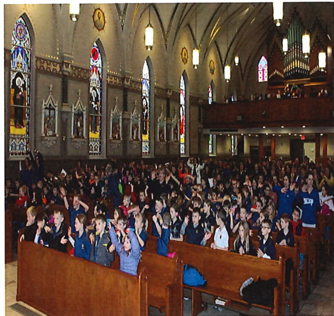
Students from SPPS & St. Gregory's celebrate mass together for Catholic Schools Week

Weekday Servers: Feb. 4, Feb. 6, Feb. 8 (Tue 6 PM, Thurs 7 AM, Sat 7:30 AM) Colby Frehe & Tanner Schmelzle Feb. 5, Feb. 7 (Wed 8 AM, Fri 8 AM) SPPS Students