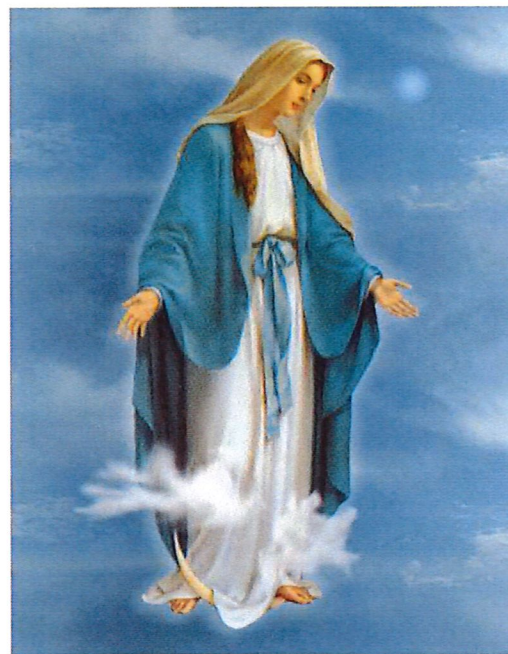
Assumption of the Blessed Virgin Mary