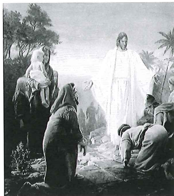
We have found the Messiah: Jesus Christ, who brings us truth and grace. John 1:41