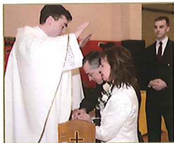
A priest gives his parents his blessing after his ordination.

The mother of Pope St. Pius X was present at his installation as pope in 1903. She kissed his large papal ring, as is the custom, then she presented her tiny hand with her wedding ring and said, "Now you kiss my ring—for without it, you never would have received yours!"